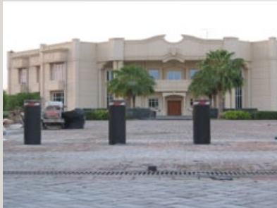
H.H. Sheikh Villa (Dubai)