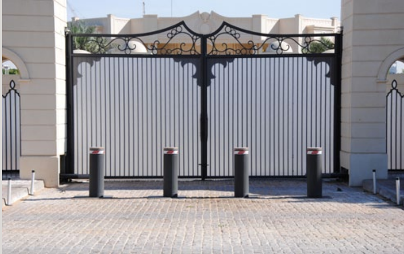
H.H. Sheikh Villa (Dubai)