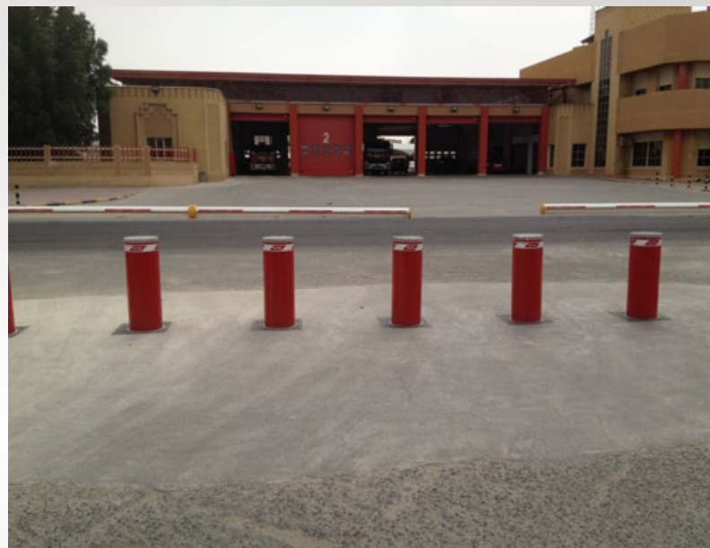
Huwait Fire Department