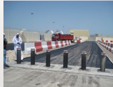
French Naval Base, Abu Dhabi Zayed Port