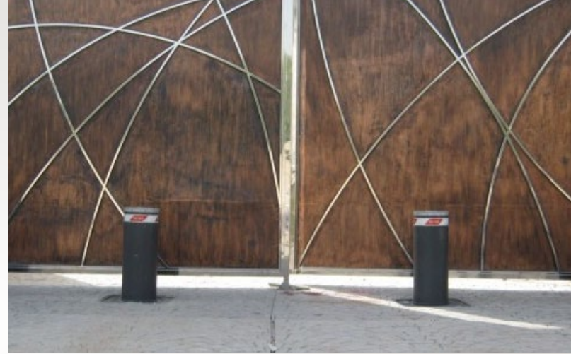
VVIP Residence (Dubai)