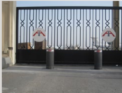
Fujairah International Airport