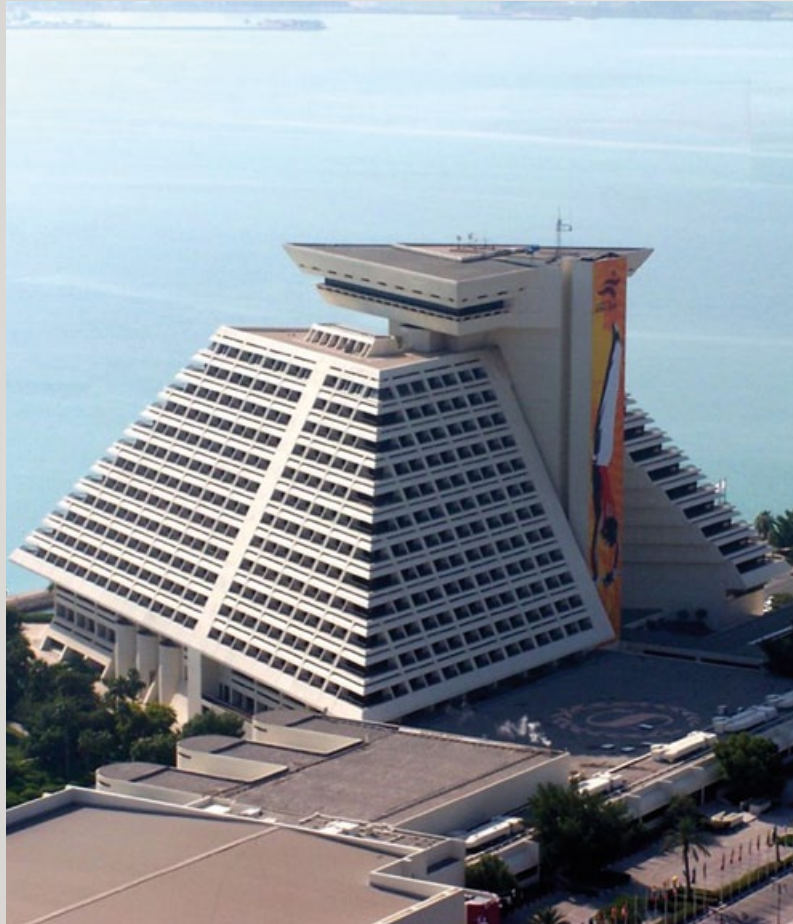
Sheraton Hotel Doha