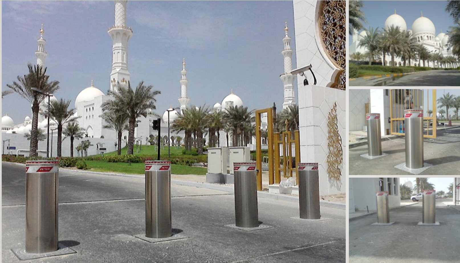
Installation with automatic rising bollards 275H4/900A