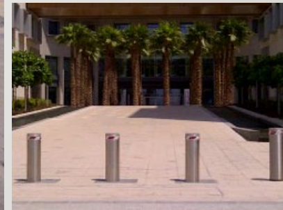
Installation with automatic rising bollards 275H12/900A