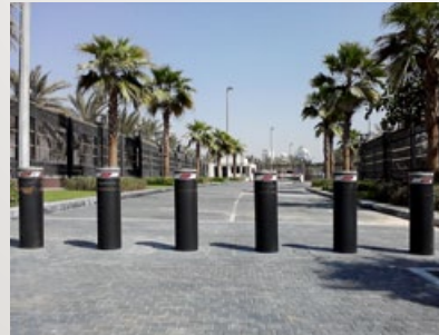
Dubai Ruler's Court