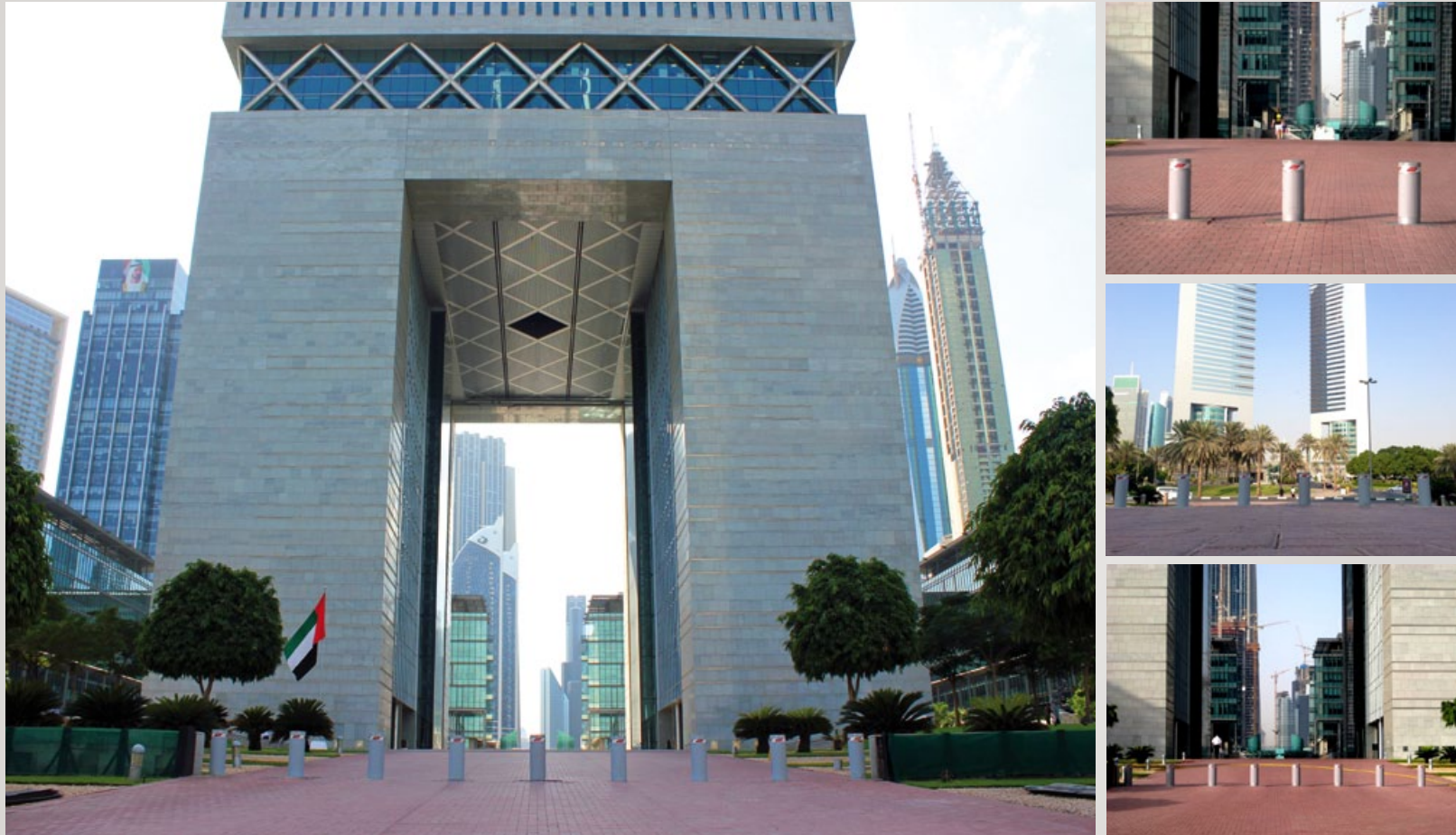
Installation with automatic rising bollards 275H4/700A