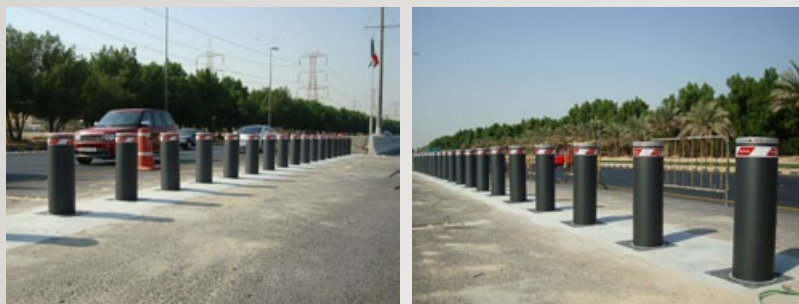
Bayan Palace of Hawalli Governorate