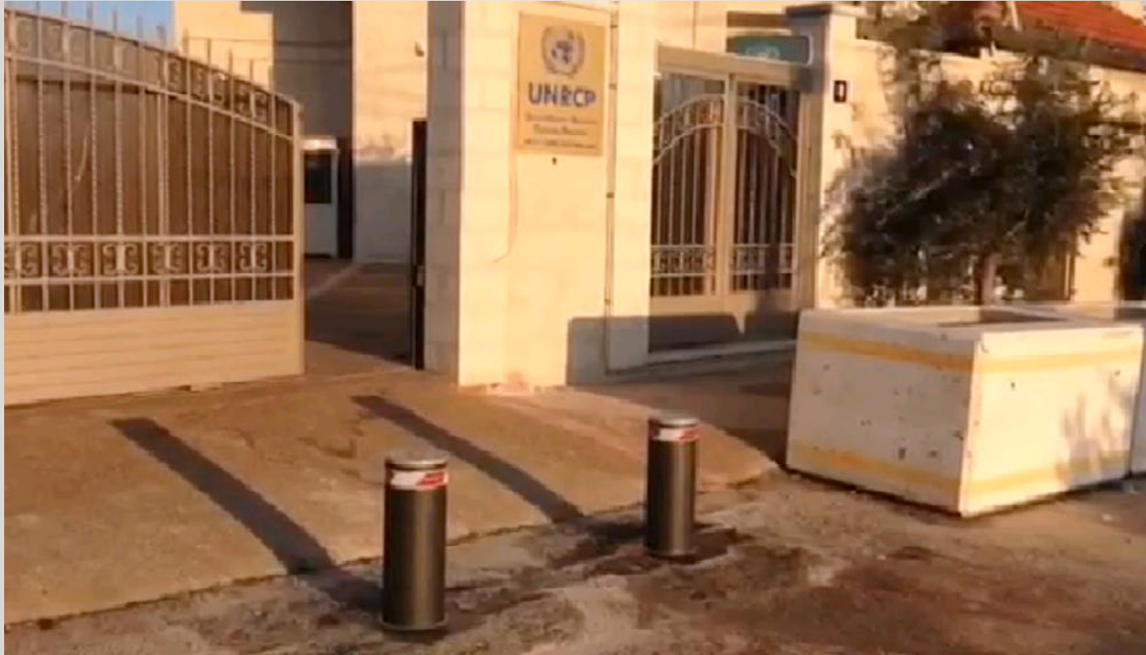
Installation with automatic rising bollards 220P/600A