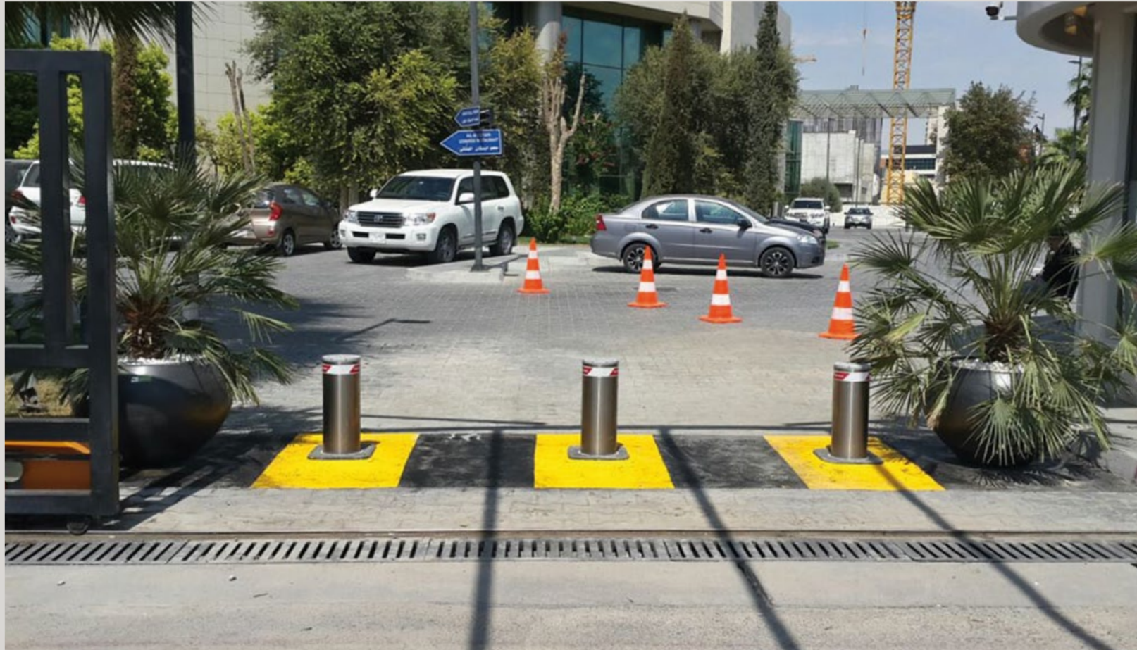
Rotana hotel in Erbil