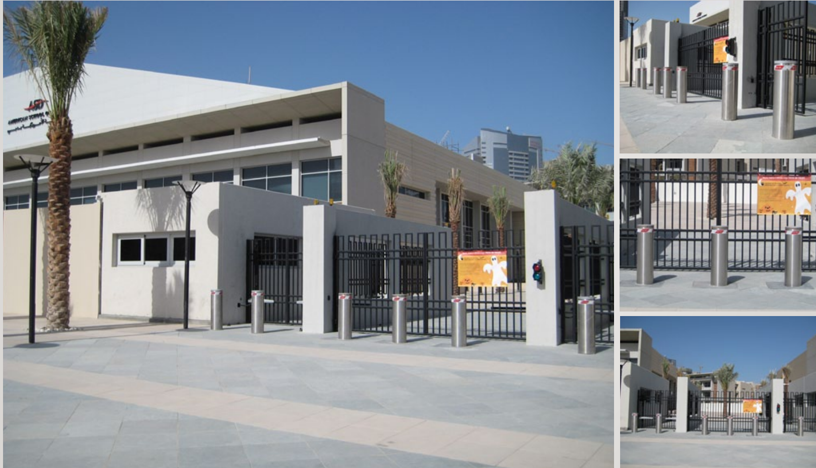
Installation with automatic rising bollards 275H12/900A