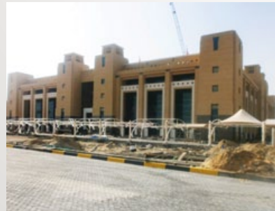
Ministry of Interior Abu Dhabi